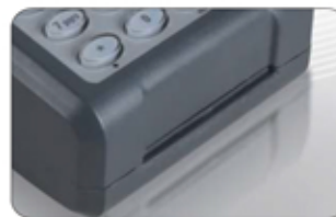
Smart Card Reader