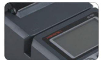
Magnetic Swipe Card Reader