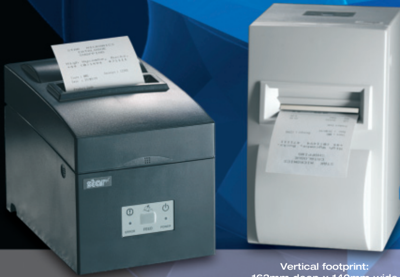
Vertical footprint: 163mm deep x 140mm wide

The new, logic seeking SP500 Series offers an unbeatable price / performance ratio unmatched by any other manufacturer