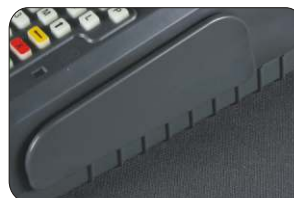
Magnetic Swipe Card Reader